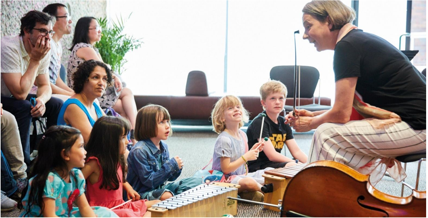
A workshop at an LSO Discovery Family Concert

The closing date for applications is 5.30pm on Friday 21 February 2025.