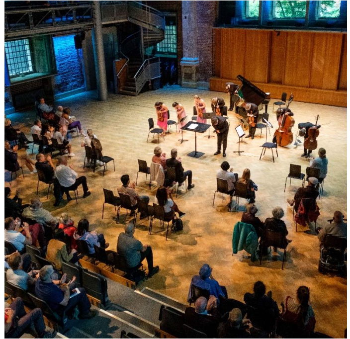
A Lunchtime Concert at LSO St Luke's