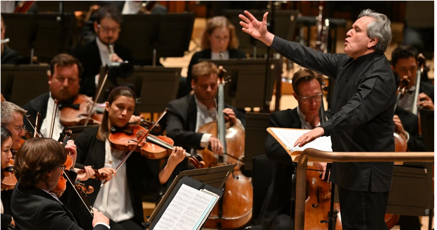
The LSO with Sir Antonio Pappano on the Barbican stage

The London Symphony Orchestra was established in 1904, as one of the first orchestras shaped by its musicians. Since then, generations of remarkable talents have built the LSO's reputation for uncompromising quality, and inspirational repertoires.