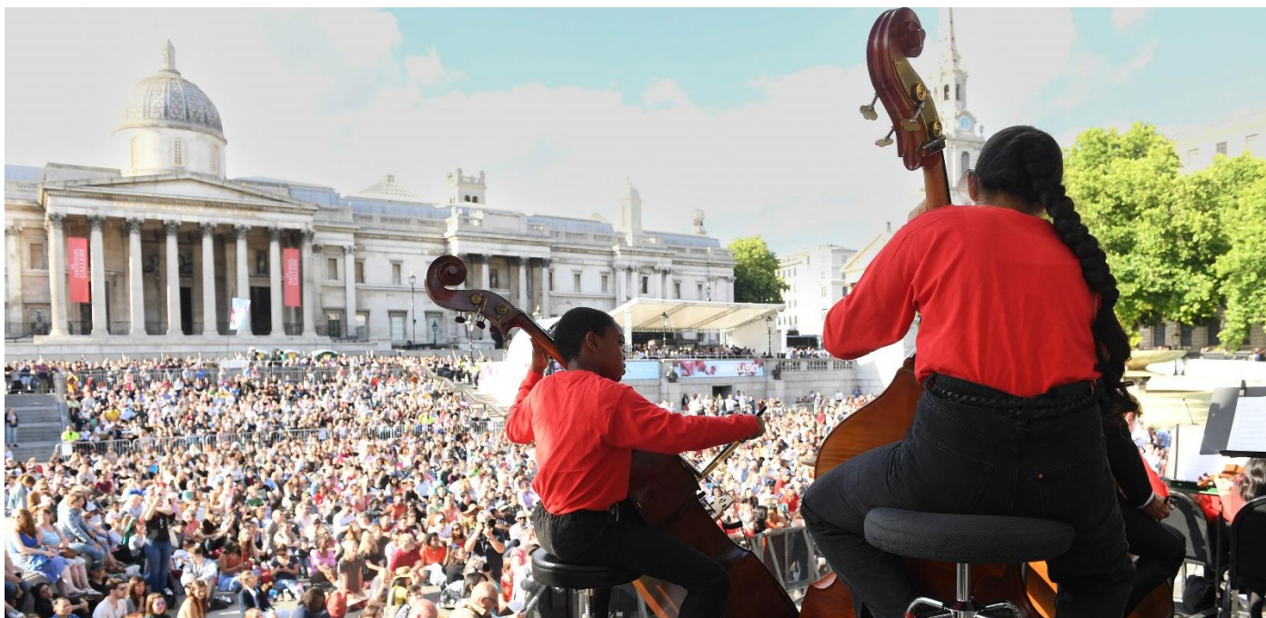
Young musicians performing on-stage at BMW Classics in Trafalgar Square