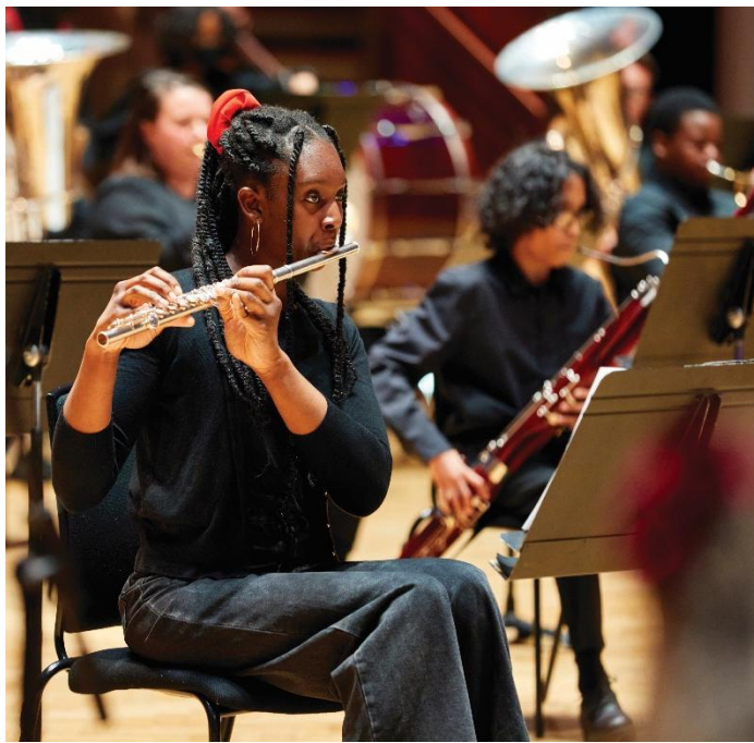
LSO East London Academy young musicians